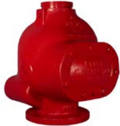
MODEL G-3 FLANGE/GROOVE

Rubber parts are of selective materials which have good abrasive resistance and long life expectancy in terms of resiliency.