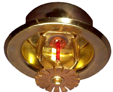
RESIDENTIAL RECESSED PENDENT