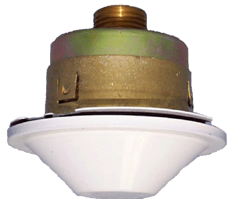
RESIDENTIAL CONCEALED PENDENT