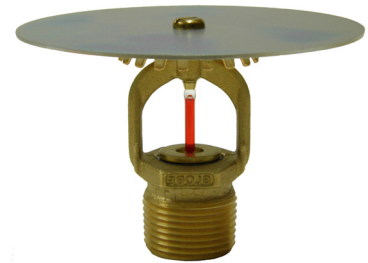
SERIES GL-QR/ST/INT QUICK RESPONSE UPRIGHT

The heart of Globe's Series GL-QR sprinkler proven actuating assembly is a hermetically sealed frangible glass ampule that contains a precisely measured amount of fluid. When heat is absorbed, the liquid within the bulb expands increasing the internal pressure. At the prescribed temperature the internal pressure within the ampule exceeds the strength of the glass causing the glass to shatter. This results in water discharge which is distributed in an approved pattern depending upon the deflector style used.