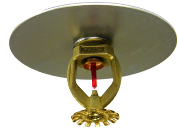
SERIES GL-QR/ST/INT QUICK RESPONSE PENDENT