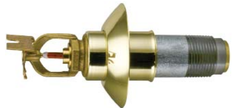
SLEEVE & SKIRT