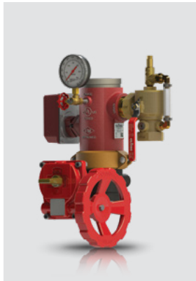
UM Universal Manifold