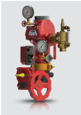
UMC Universal Manifold Check